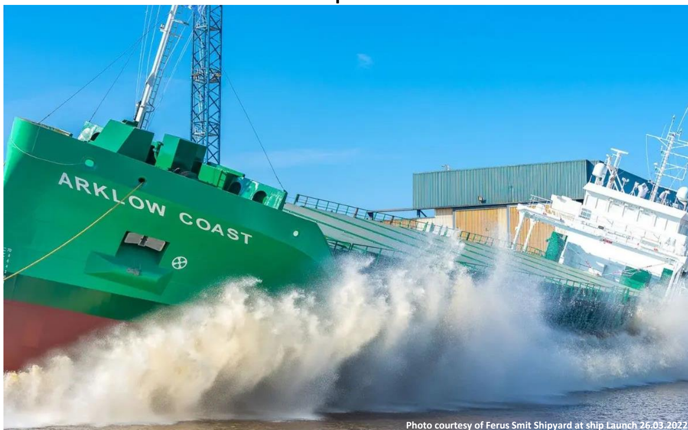
at ship Launch 26.03.2022